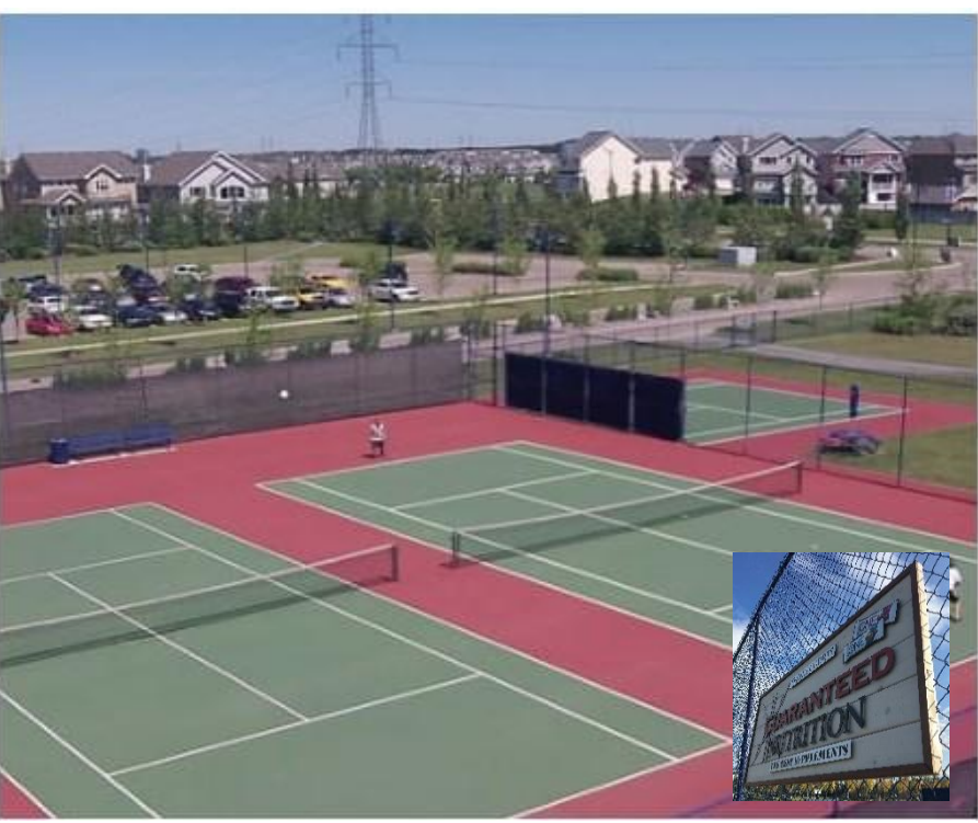
Example of sponsor sign displayed on the right

Residents can enjoy tennis while playing on the courts named after your organization! Two tennis courts and a practice court are available to residents each summer. The naming sign is located in one of the most visible and high traffic areas of the park.