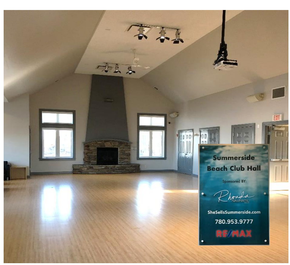
Example of sponsor sign displayed on the right

The Summerside Beach Club Hall is one of the most sought after venues of the Summerside Residents Association. Home to both programs and rentals, the hall is booked for over 800 functions and classes each year, and we receive several phone inquiries per day. The Sponsor's name will be included in the name of the hall and referred to in all correspondence. Our hall overlooks our beautiful 32 acre lake. Currently sponsored until July 2020.